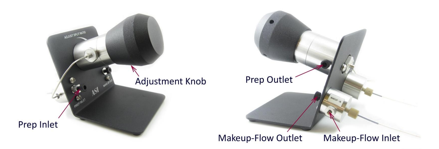
Figure 2: QuickSplit Adjustable Makeup-Flow Splitters

Figure 1: (left) QuickSplit Adjustable Makeup-Flow Splitters (right) Split flow indicator rod scale on rear panel